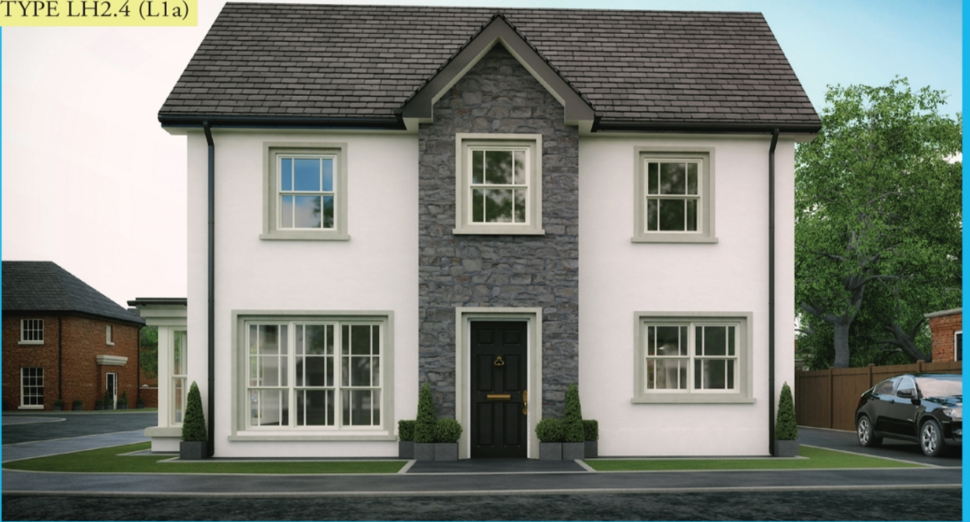
TYPE LH2.4 (L1a)